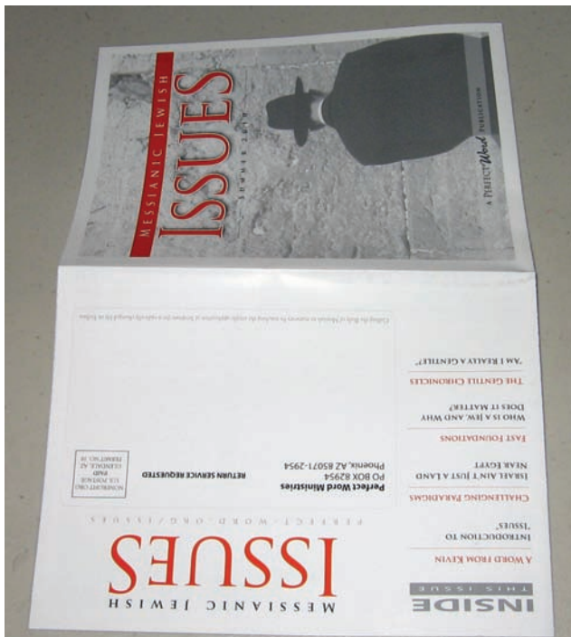
Fig 3 -- Second fold -- in half (7" in from left)