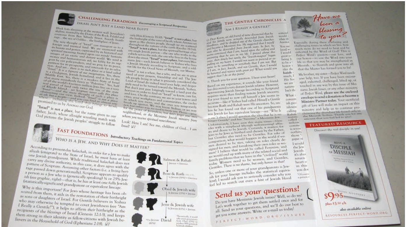
Fig 3 -- Second fold -- in half (7" in from left)